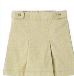
Khaki or Navy Blue