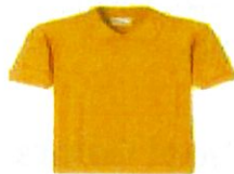
Gold – Not Yellow (School Color)