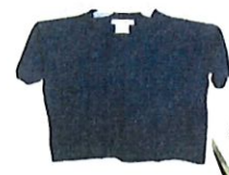
Dark or Navy Blue

Uniform polo shirts and button down shirts (short sleeve) are available in stores and online at Target, Walmart, Kmart, JCPenney's and Sears. Prices range from $5-$12 with Walmart having the least expensive shirts. To order online, go to any of their websites and put "school uniform" in the search field.